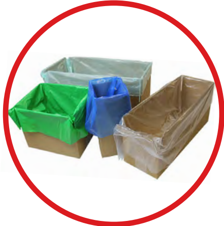
Clear & Colored Box Liners Available

USDA / FDA approved, BRC and AIB Certified polyliners for small to bulk sized packaging.