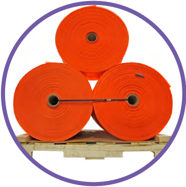
Orange Film Rolls

Plascon films are manufactured in our Traverse City, Michigan blown films plant. As a manufacturer, we are able to identify and create exactly the right film to meet your application and needs. Our food grade liners are made using resins that are USDA / FDA approved, and are both BRC and AIB certified. Liners can be made in clear plastic or any color, and one-color printing is also available.