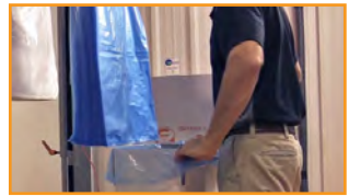
3. Fold over Side