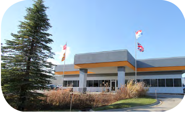
Plascon US Corporate Headquarters